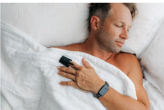
Good Sleep Test

Ideal for pharmacies ready to expand their sleep offering with more advanced, diagnostic-quality testing. Test offered: Somnofit .