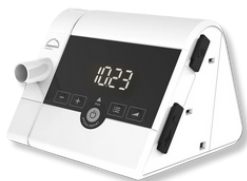
Löwenstein Prisma SOFT/SMART

Equipped with prismaRECOVER and Löwenstein's state-of-the-art algorithm, this device offers unmatched insights into your sleep quality.