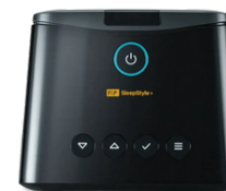
Fisher & Paykel SleepStyle+

Combines advanced technology with ease of use. Offering the SensAwake feature for a complete night's rest.