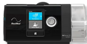
ResMed AirSense 10

Simple and intuitive, this device uses intelligent AutoRamp detection and an Easy-Breath motor for maximum comfort.